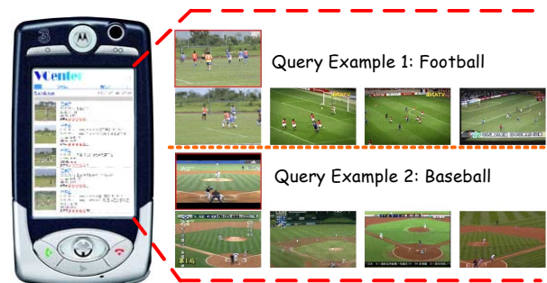
Figure 2. Example search results.

algorithm. Figure 2 has shown the block diagram of the proposed mobile search, which includes an off-line stage and an on-line query stage. In the off-line stage, each video in archives is initially segmented into video shots by using Reynolds Transport Theorem proposed by 0. For each shot, only several representative frames (i.e., key frames) are employed for indexing. Our framework use SIFT [2] algorithm to generate image signature for key frame. In contrast to global image feature, local descriptor techniques like SIFT have higher resistibility against image distortion. During on-line query stage, each query descriptor extracted from query photo vote to their closest video in the database. Approximate-Nearest-Neighbor (ANN) [1] search technique is employed to reduce the system response time. Finally, the relevant videos in database will be returned according to the voting information. Figure 3 has shown two examples of query and their corresponding search results.